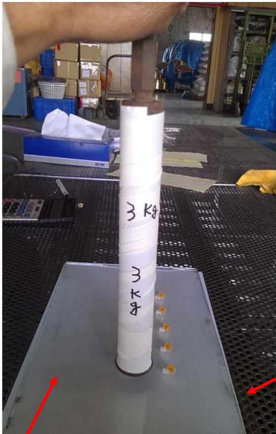
Glass plate electronic scales under glass plate